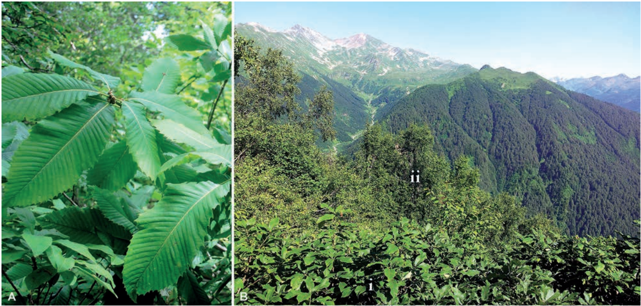
Figure 2 Quercus pontica C. Koch. communities in landscapes of Greater Caucasus. A – endemic Pontic oak Quercus pontica – creeping shrub (sometimes a low tree) 3–5 m tall, with big leaves (up to 35 cm long); it locally occurs in the Western Caucasus; B – subalpine Quercus pontica krummholz (i) with Betula litvinovii Doluch. at the background (association Rhododendro lutei–Quercetum ponticae ass. nova hoc loco) (ii) occurring as small patches on very steep (45–60°) slopes at the upper boundary of the forest belt at altitudes 1800–2150 m. Quercus pontica forms a very dense 2–3 m high shrub layer with a cover 90–100 %. in the upper reaches of the Pskhu River (right tributary of the Bzyb River, Abkhazia)

However, their integrations at the highest hierarchical level of the dendrogram in two clusters (H1 and H2, Fig. 3) were determined to a greater extent by the high values of cover (predominance effect) of the three main dominants – Quercus pontica , Betula litvinovii , B. medvedievii but not by the floristic composition of the communities as a whole. Therefore, it was not possible to objectively assess the position of associations in the higher units system of floristic classification based on the analysis performed. To reduce the excessive influence effect of the few main dominants and increase the importance of the floristic criterion, the three species, Quercus pontica , Betula medvedievii and B. litvinovii were combined into one combination (into one “pseudo-species”) with averaged coverage indices and a cluster analysis (with the same parameters) of the entire series of relevés was performed again. As a result, six clusters (I–VI) interpreted in the previous classification as associations and three higher level clusters (A, B, C) interpreted as alliances were clearly observed on the new dendrogram (Fig. 4) as well. However, at the highest hierarchical level of new dendrogram, all these syntaxa were combined into two completely different clusters (H3 and H4) which according to floristic criteria were defined as two different classes of