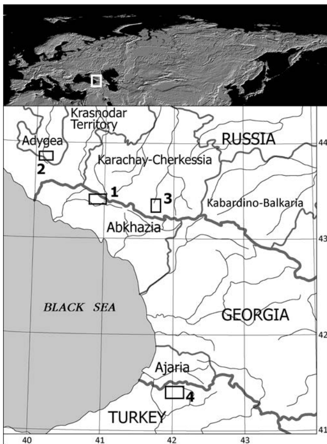
Figure 1 Geographical locations of relevés used for the syntaxonomic analysis: 1 – relevés made by Nikolai Ermakov in the Pskhu River Basin, Abkhazia (Western Caucasus), 2 – relevés from the upper part of the Belaya River Basin (North-Western Caucasus) (Sokolova 2013), 3 – relevés from Teberda Nature Reserve (Northern Caucasus) (Onipchenko 2002), 4 – relevés from the Lesser Caucasus (Eminagaoglu et al. 2006)

The studied area is located in the subalpine zone of the Pskhu River basin (right tributary of the Bzyb river, Abkhazia) (Fig. 1). This territory is placed on the southern spurs of the Greater Caucasus ridge (the western part) at altitudes 1800–2300 m a.s.l. The mountain ranges are composed mainly of ancient crystalline rocks – gneisses, crystalline schists and granites. The relief is characterized by very steep mountain slopes with slow erosion processes, open outcrops and narrow gorges (Kamanin et al. 1974, Antonov et al. 1977). The climate at an altitude of about 2000 m is moderately cold and very humid. The average annual temperature is 3.9°C. The average temperature of the warmest month (August) is 10–12°C, the coldest month (January) is -6° – -8°C. Winter lasts 5–6 months but deep snow cover lasts longer. The average annual precipitation reaches 2000–2500 mm (Gvozdetsky 1963) that brought by active Mediterranean cyclones through the western part of the Caucasus. Snow cover reaches 4 m depth in winter